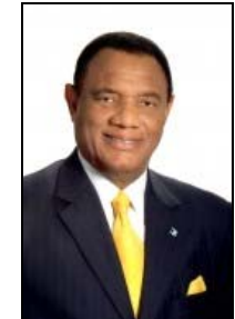
Hon. Perry G. Christie